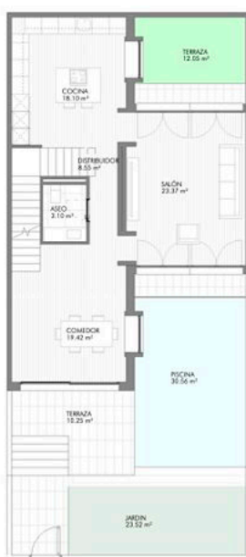
PLANTA BAJA 1 : 100