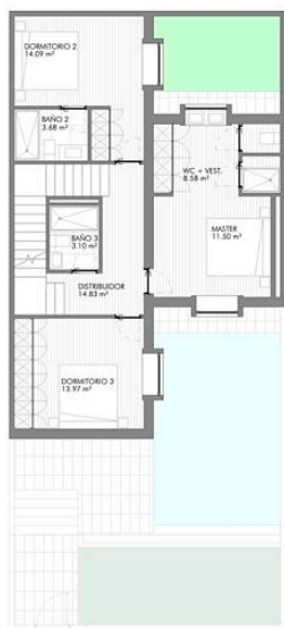
PLANTA PRIMERA 1 : 100