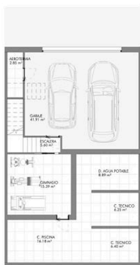
PLANTA SOTANO 1 : 100